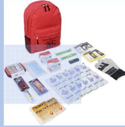
From Amazon: $104.95 2 Person First My Family All-in-One 72 Hour Bug Out Bag Emergency Survival Kit for Family. Be Prepared for Hurricanes, Floods, Tsunami, Other Disasters