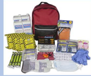
From Walmart: $117.98 Ready America 70380 72 Hour Emergency Kit, 4-Person , 3-Day Backpack, Includes First Aid Kit, Survival Blanket, Portable Preparedness Go-Bag for Camping, Car, Earthquake, Travel, Hiking, and Hunting

A basic search of the internet identified three examples of travel type emergency kits. If you have no idea where to start, these or other similar kits would be a good place. It is best however to customize a kit to your specific lifestyle and needs.