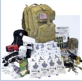
From Amazon: $164.99 2 Person EVERLIT Complete 72 Hours Earthquake Bug Out Bag Emergency Survival Kit for Family. Be Prepared for Hurricanes, Floods, Tsunami, Other Disasters